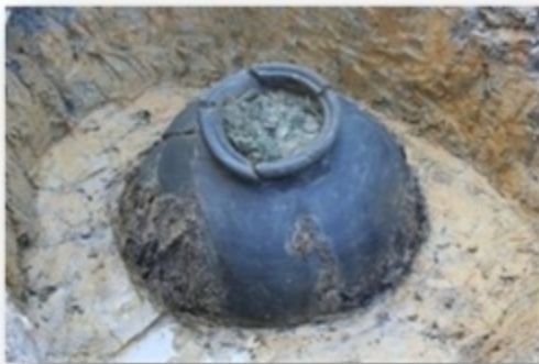
British Hoard Discovered 2007 Containing 52,000 Roman Coins

During the worst periods of the Great Depression, many communities were temporarily deprived of normal monetary supplies and functions because of bank failures, hoarding of money, and inability to collect taxes. People simply had no money to spend. To counteract this situation, various forms emergency currency or "scrip" were issued. The first of these appeared as early as 1931, though it was not until a year later that it was being issued in any appreciable quantities. By February of 1933, according to a Bureau of Foreign and Domestic Affairs estimate, there were over 400 communities using some form of emergency fiat currency – and this was before the official "bank holiday" and the resulting flood of scrip across the country. Gold was hoarded – not used as money.